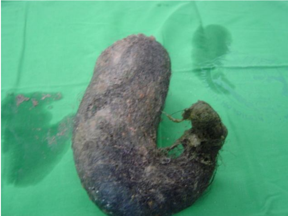
Fig. 2. Full-size trichobezoar after complete evacuation.

A huge trichobezoar cast the whole stomach with tail extension to the pylorus and first part of the duodenum. It was evacuated completely intact (Fig. 2).